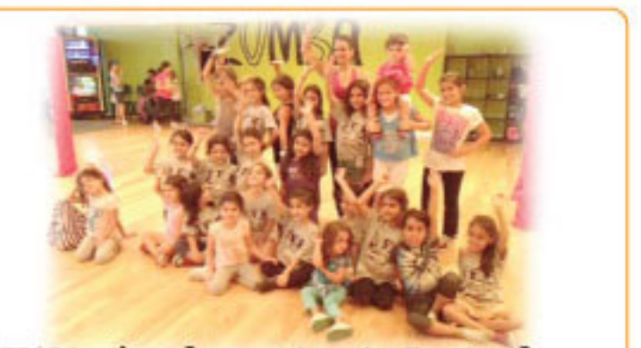
SHAI is pleased to continue its Persian dance series featuring the next generation of Persian dancers.

PLUS Kosber Pizza Luncb Info@sbaiusa.org to reserve