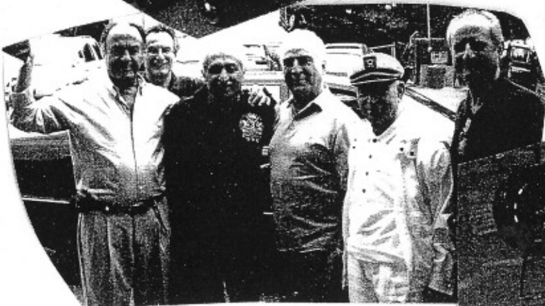
FUN FOR ALL AGES!